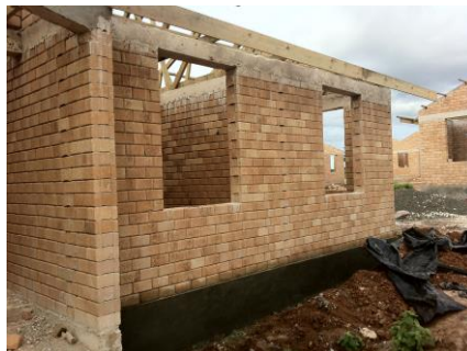
Figure 2. Application of rules of thumb for cross ventilation to building

A recent example that showcases the rule-of-thumb application of cross-ventilation principles to simple, low-cost housing typologies, saw a solution placing window opening on diagonally opposite walls. This placement however did not take into consideration a pertinent element in the design of spaces, the actual use of the room. As a bedroom the position of the bed is particularly important, and with the two full size windows, placing a bed in the space is difficult, given most people are not comfortable with the head of the bed directly beneath a low level window sill. While the application of the principle of ventilation was achieved, the practicality of the solution is clearly undesirable.