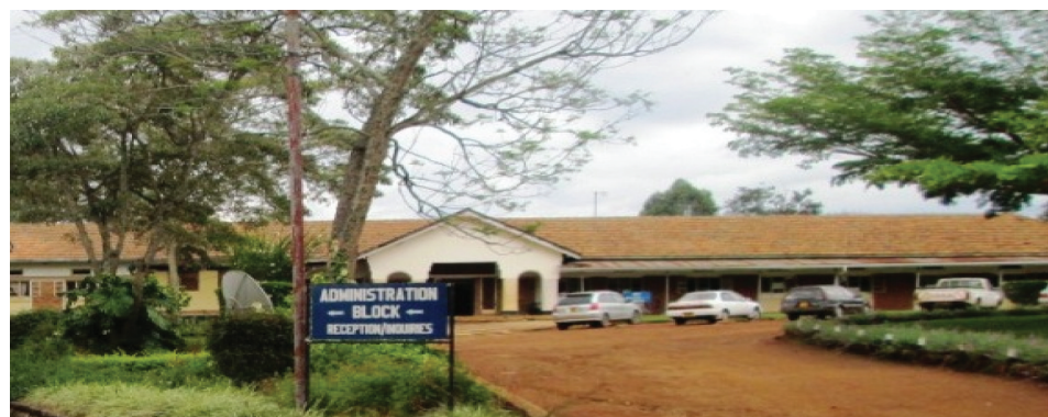
Figure 1. Out-patient Department of St. Joseph Hospital _ Kitovu.

According to World Health Organization [WHO] (2015), the ideal rate for caesarean sections is between 10% and 15%. Over the years, however, caesarean sections have become increasingly common in both developed and developing countries. When medically necessary, a caesarean section can effectively prevent maternal and newborn mortality. WHO further argues that when caesarean section rates rise toward 10% across a population, the number of maternal and newborn death decreases. When the rate goes above 10%, there is no evidence that mortality rates improve. The lack of a standardized internationally accepted classification system to monitor and compare caesarean section rates in a consistent and action-oriented manner is one of the factors that has hindered a better understanding of the trend of Caesarean section rates. The practice of standard precautions is very important in improvement of services (Mohd-Nor & Bit-Lian, 2019).